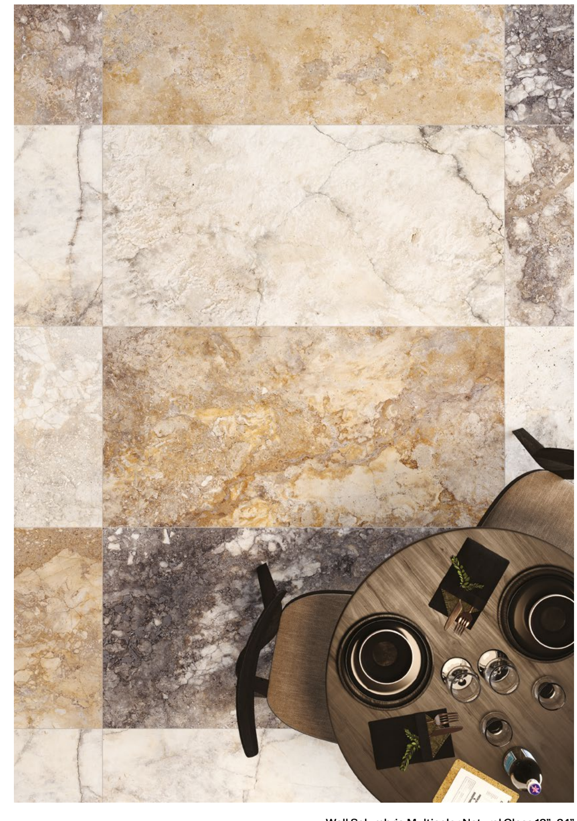
Wall Solumbria Multicolor Natural Gloss 12"x24" Floor Solumbria Multicolor Honed+ 24"x48"