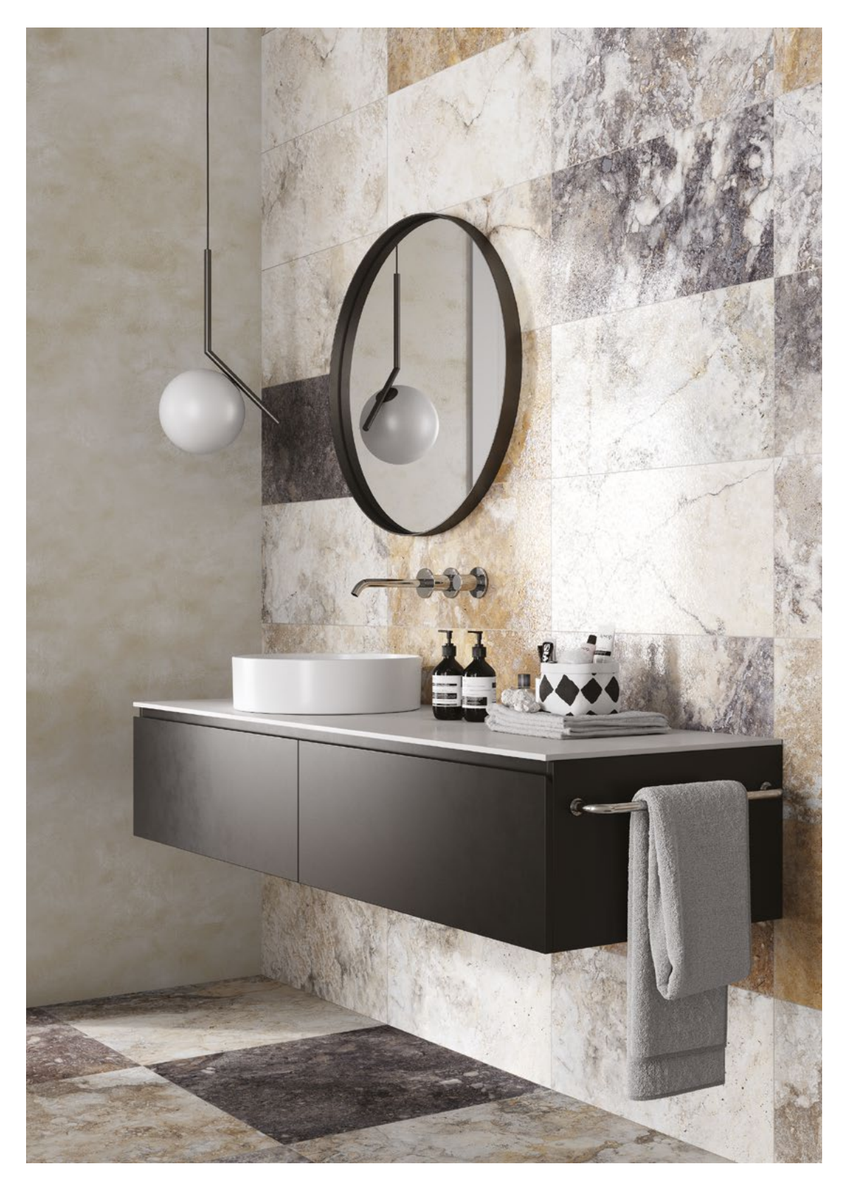
Wall Solumbria Multicolor Natural Gloss 12"x24" Floor Solumbria Multicolor Honed+ 24"x24"