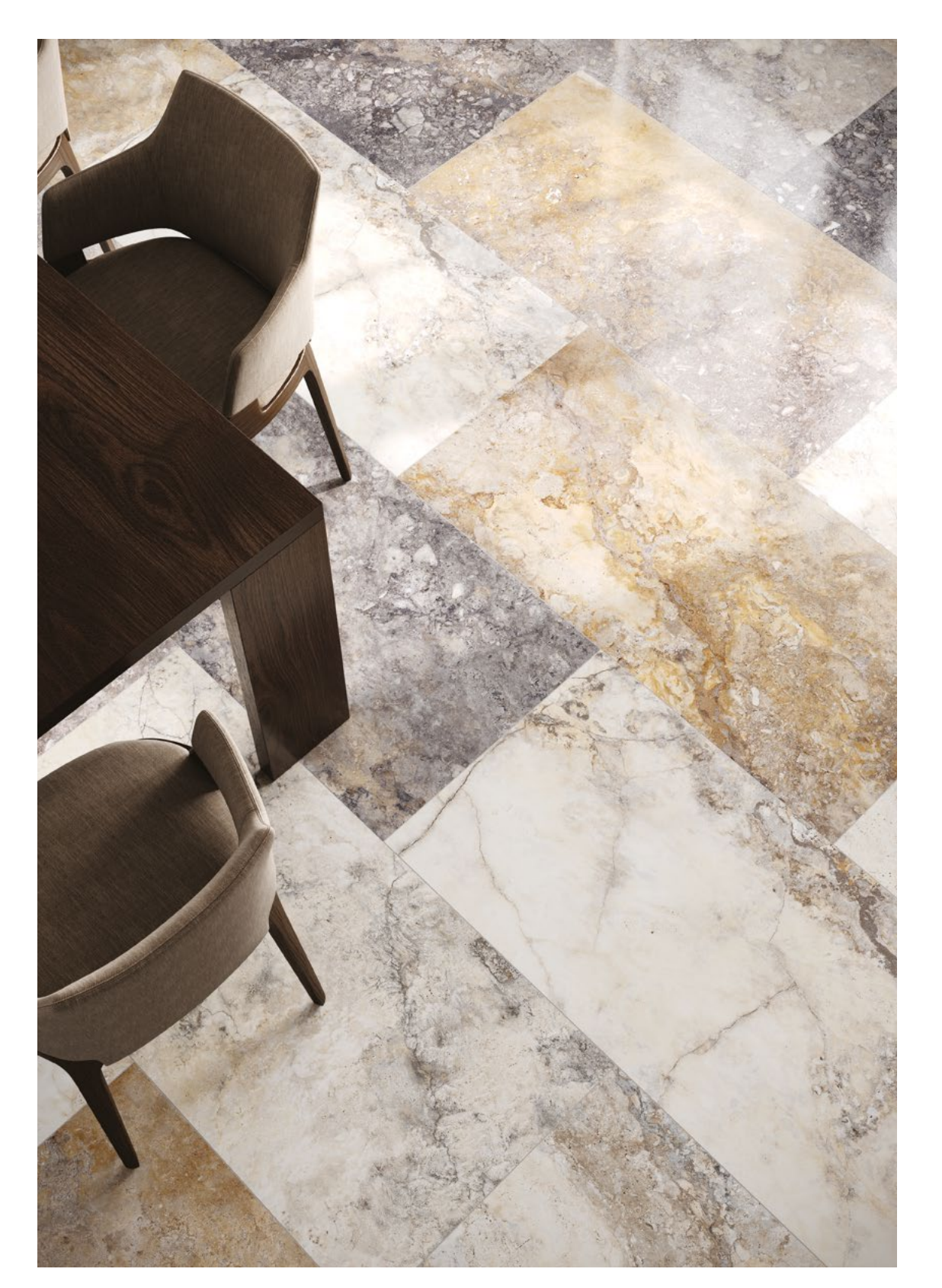
Wall Solumbria Multicolor Natural Gloss 12"x24" Floor Solumbria Multicolor Natural Gloss 24"x48"