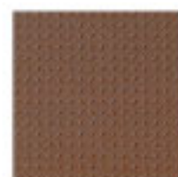
Red Clay Ind