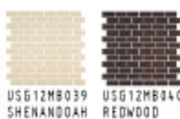
USG12MB039 USG12MB040 SHENANDOAH REDWOOD