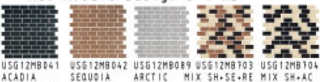
USG12MB039 USG12MB040 USG12MB041 USG12MB042 USG12MB089 USG12MB703 USG12MB704 SHENANDOAH REDWOOD ACADIA SEQUOIA ARCTIC MIX SH+SE+RE MIX SH+AC