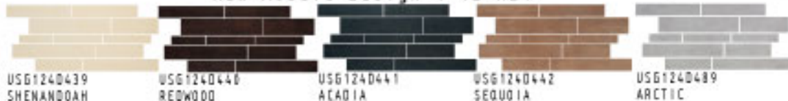
USG1240439 USG1240440 USG1240441 USG1240442 USG1240489 SHENANDOAH REDWOOD ACADIA SEQUOIA ARCTIC