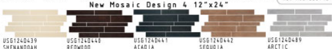
USG1240439 SHENANDOAH USG1240440 REDWOOD USG1240441 ACADIA USG1240442 SEQUOIA USG1240489 ARCTIC