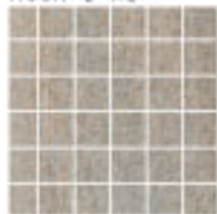
USG12M0098 LIME 2"x2"