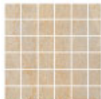
USG12M0097 SUNSET 2"x2"