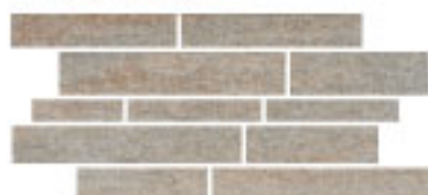
USG1240498 LIME 12"x24"