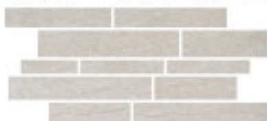
USG1240496 MOON 12"x24"