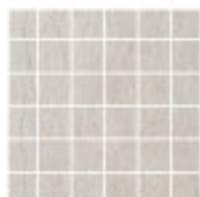
USG12M0096 MOON 2"x2"