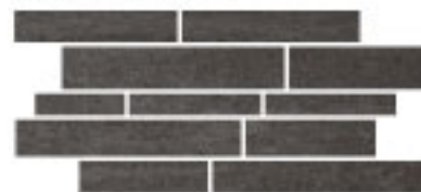
USG1240499 IRON 12"x24"