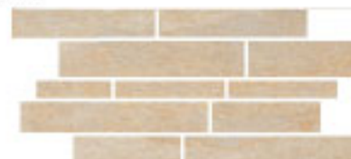
USG1240497 SUNSET 12"x24"