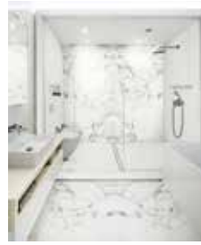
ARABESCATO VENA A-B