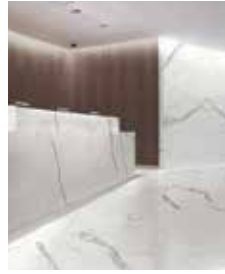
EXTRA VENA A-B