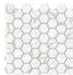
CALACATTA VENA CLASSICO