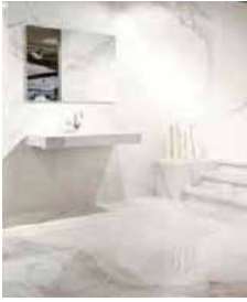
CALACATTA VENA A-B