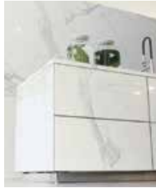
CALACATTA VENA CLASSICO