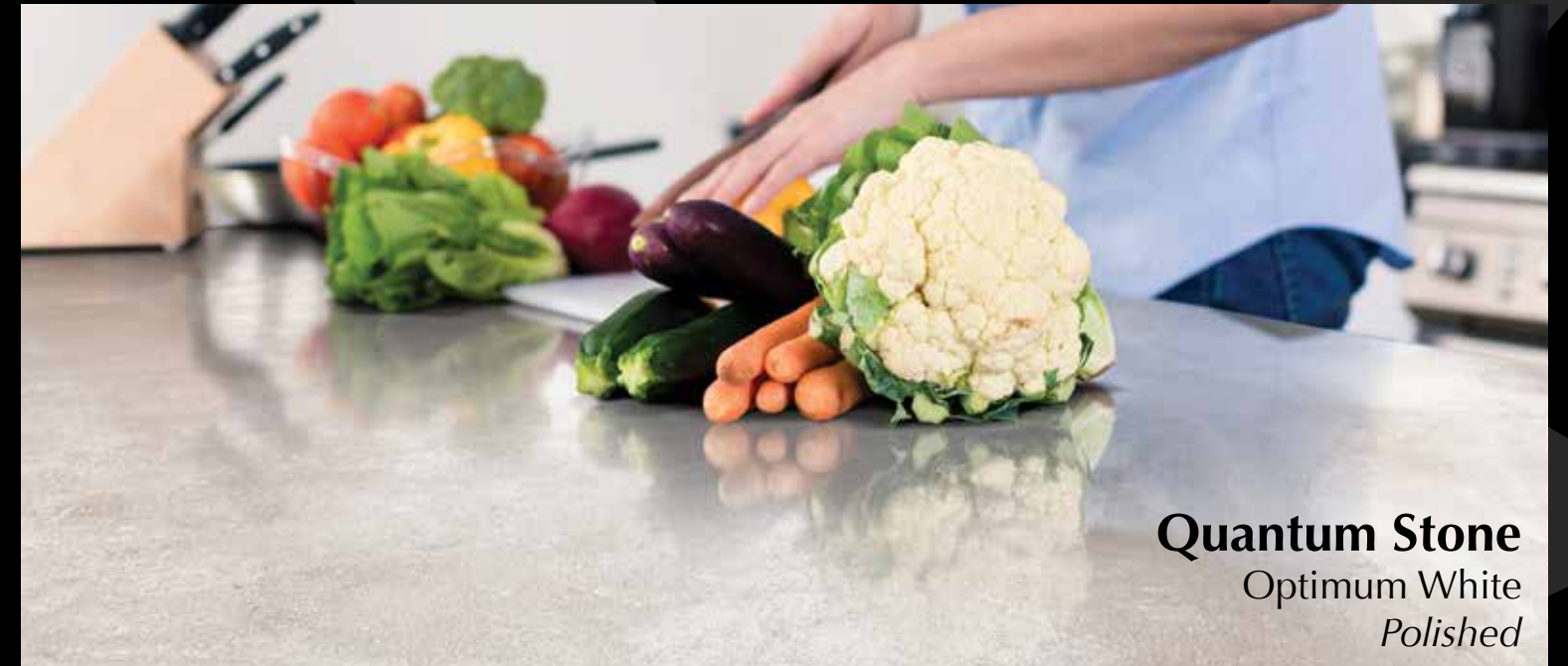
Quantum Stone Optimum White Polished