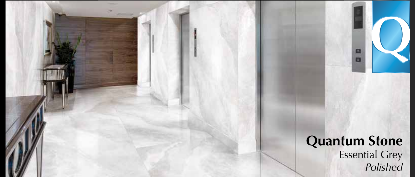
Quantum Stone Essential Grey Polished