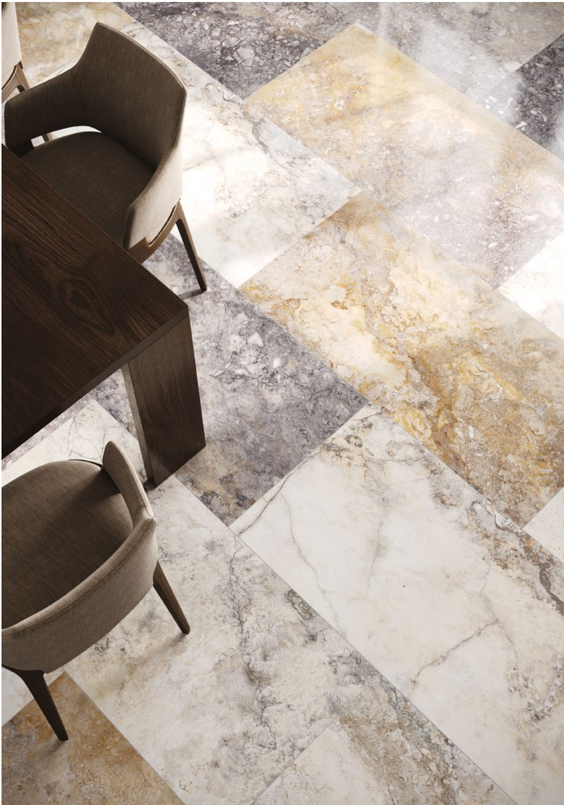
Wall Solumbria Multicolor Natural Gloss 12"x24" Floor Solumbria Multicolor Natural Gloss 24"x48"