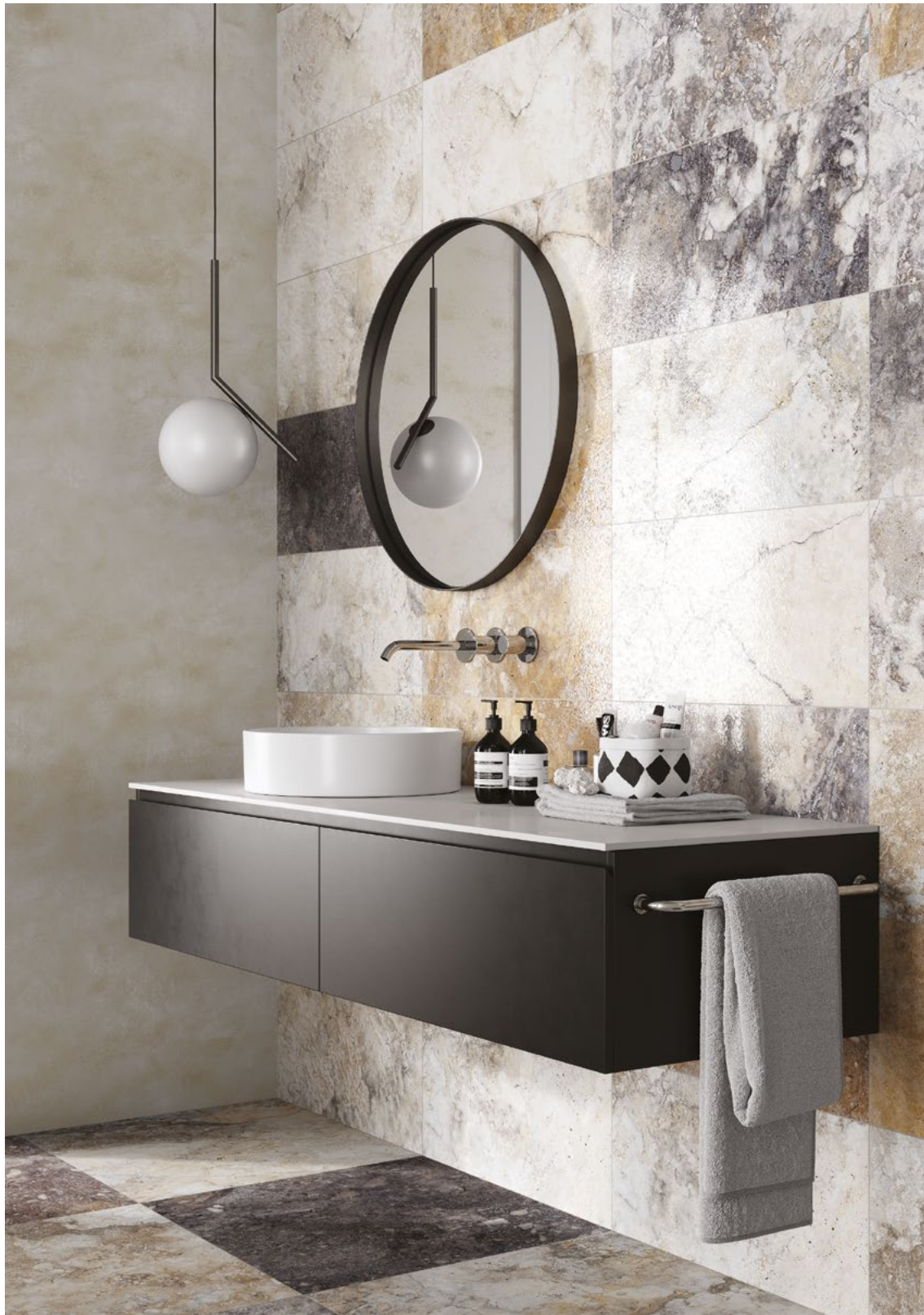
Wall Solumbria Multicolor Natural Gloss 12"x24" Floor Solumbria Multicolor Honed+ 24"x24"