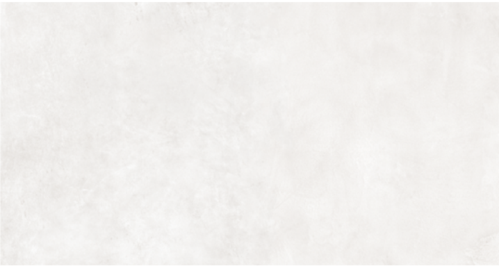
48"x48" DIG4848096 Natural DIP4848096 Polished