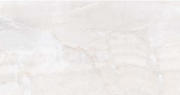
48"x48" DIG4848095 Natural DIP4848095 Polished