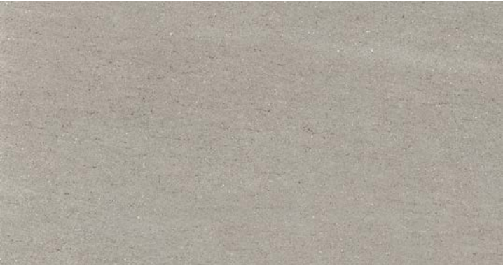
48"x48" DIG4848117 Natural