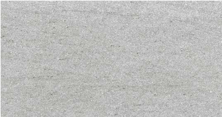
48"x48" DIG4848118 Natural