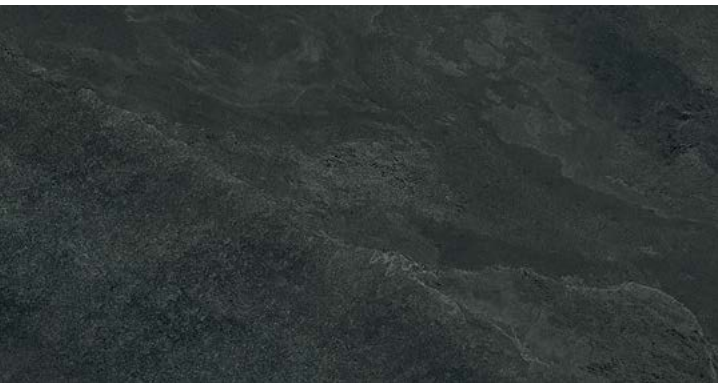
24"x48" DIG2448093 Natural