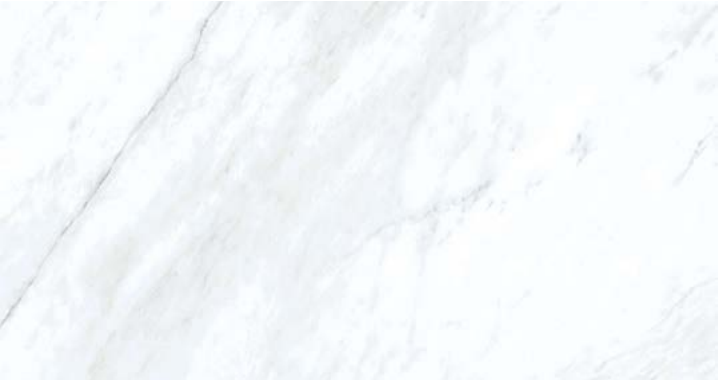
48"x48" DIG4848078 Natural DIP4848078 Polished