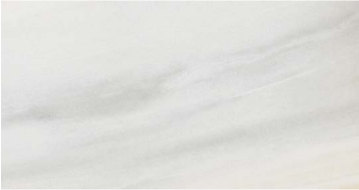
24"x48" DIG2448121 Natural DIP2448121 Polished