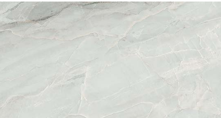
24"x48" DIG2448092 Natural DIP2448092 Polished