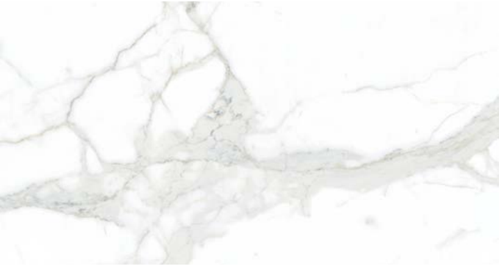
48"x48" DIG4848075 Natural DIP4848075 Polished