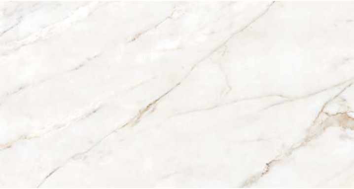
48"x48" DIG4848068 Natural DIP4848068 Polished