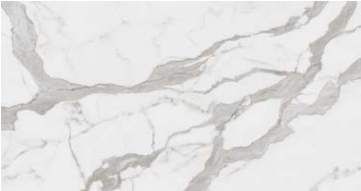
60"x126" BOOKMATCH* - 12mm I12P60126176A Polished - Not Rectified I12P60126176B Polished - Not Rectified