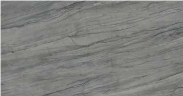
60"x126" BOOKMATCH* - 12mm I12P60126178B Polished - Not Rectified I12P60126178A Polished - Not Rectified