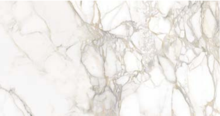
60"x126" BOOKMATCH* - 12mm I12P60126177A Polished - Not Rectified I12P60126177B Polished - Not Rectified