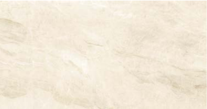
60"x126" -12mm I12P60126180 Polished - Not Rectified