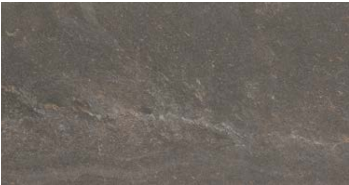
12"x24" 12"x12" MOSAIC 2"x2" BULLNOSE 3"x24" MTG1224193 Natural MTG12MO193 Natural MTG324BT193 Natural MTT1224193 Textured