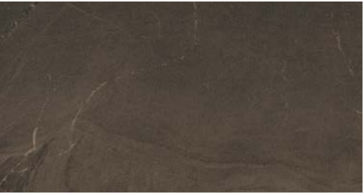
12"x24" 12"x12" MOSAIC 2"x2" BULLNOSE 3"x24" MTG1224192 Natural MTG12MO192 Natural MTG324BT192 Natural MTT1224192 Textured