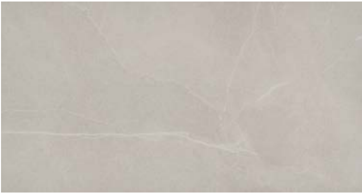
12"x24" 12"x12" MOSAIC 2"x2" BULLNOSE 3"x24" MTG1224191 Natural MTG12MO191 Natural MTG324BT191 Natural MTT1224191 Textured