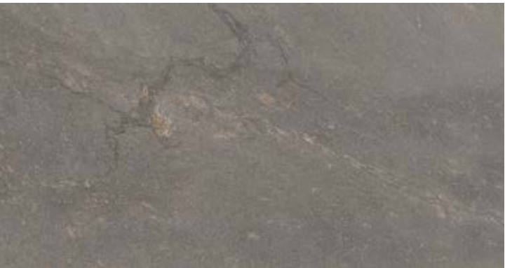
12"x24" 12"x12" MOSAIC 2"x2" BULLNOSE 3"x24" MTG1224190 Natural MTG12MO190 Natural MTG324BT190 Natural MTT1224190 Textured