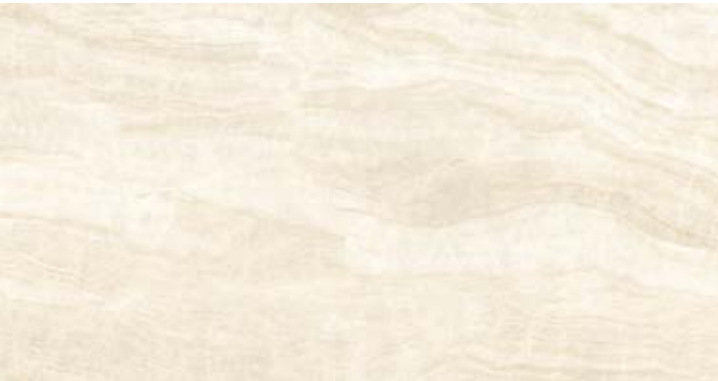
120"x60" DI6P60120070 Polished