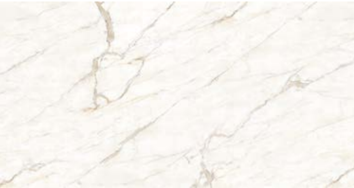
120"x60" US6G60120196 Natural US6P60120196 Polished