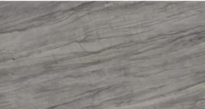
120"x60" US6G60120267 Natural US6P60120267 Polished