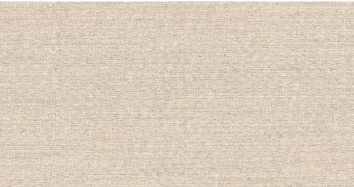
12"x24" MTG1224108 12"x12" MOSAIC 2x2 MTG12MO108 BULLNOSE 3"x24" MTG324BT108