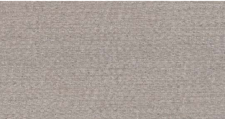
12"x24" MTG1224107 12"x12" MOSAIC 2x2" MTG12MO107 BULLNOSE 3"x24" MTG324BT107