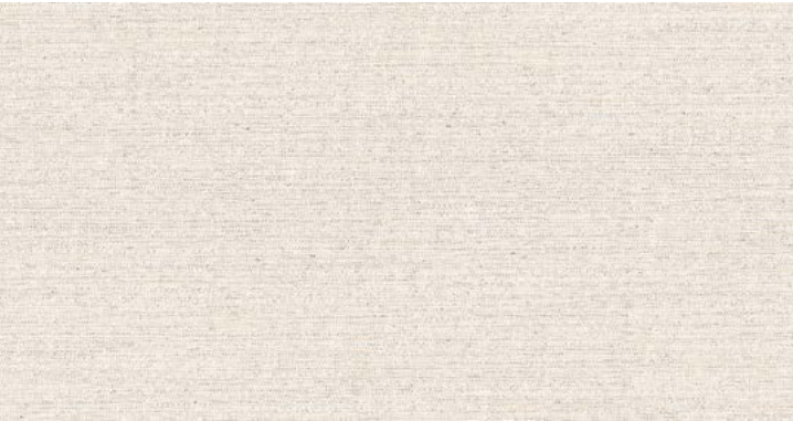
12"x24" MTG1224106 12"x12" MOSAIC 2x2 MTG12MO106 BULLNOSE 3"x24" MTG324BT106