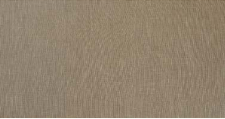
12"x24" MTG1224021 BULLNOSE 3"x12" MTG312BT21