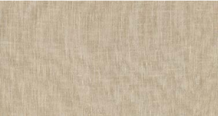
12"x24" MTG1224023 BULLNOSE 3"x12" MTG312BT23