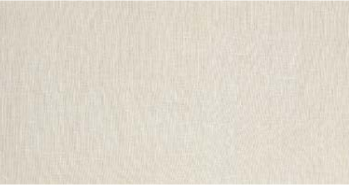
12"x24" MTG1224022 BULLNOSE 3"x12" MTG312BT22