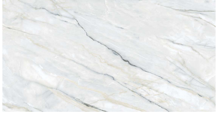
60"x120" US6G60120369 Natural US6GT60120369 Glint