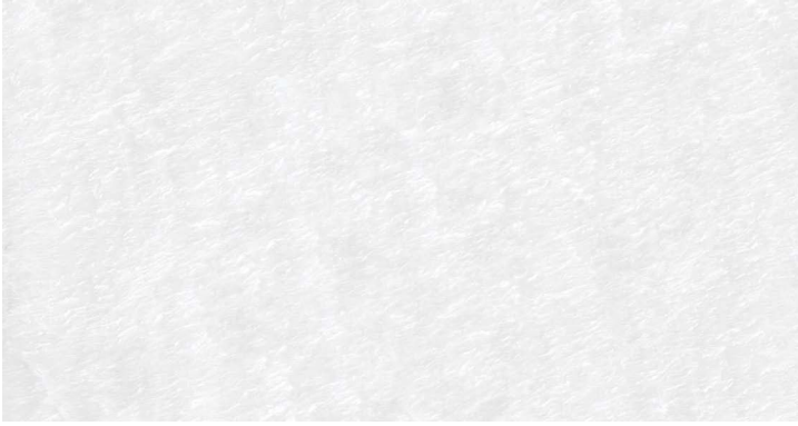
60"x120" US6GT60120365 Glint US6F60120365 Feel